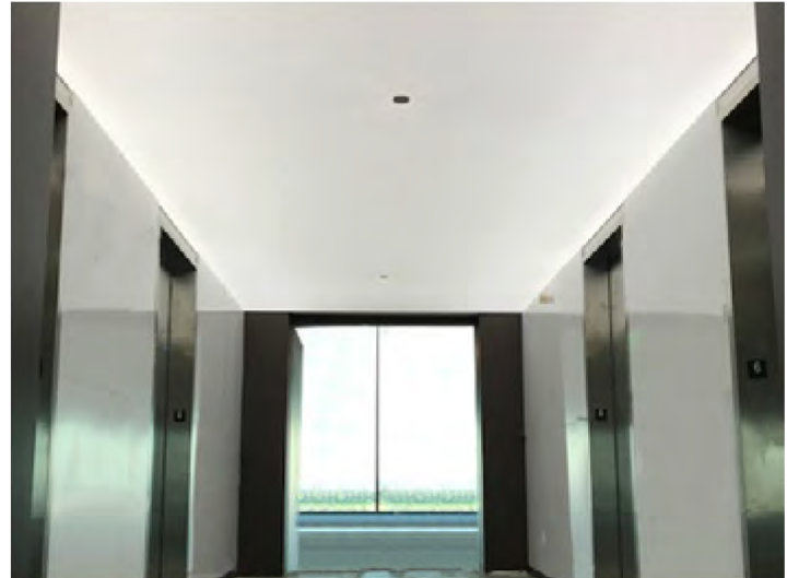
America Center: San Jose, CA - Installer: Unique Construction