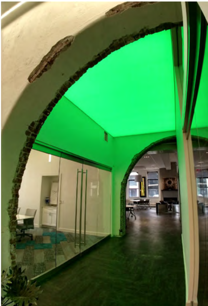
DLA Lighting Showroom: Philadelphia, PA – Installer: Unique Construction