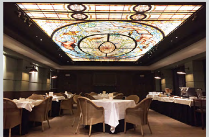
Restaurant: Belgium - Installer: MonaVisa

Discover what inspires you with SO® DECO printed coverings. Wide-span printing is available on CLIPSO Standard, Translucent and Acoustic coverings. For the most unique and customized design ideas, the possibilities are endless with SO DECO by CLIPSO.