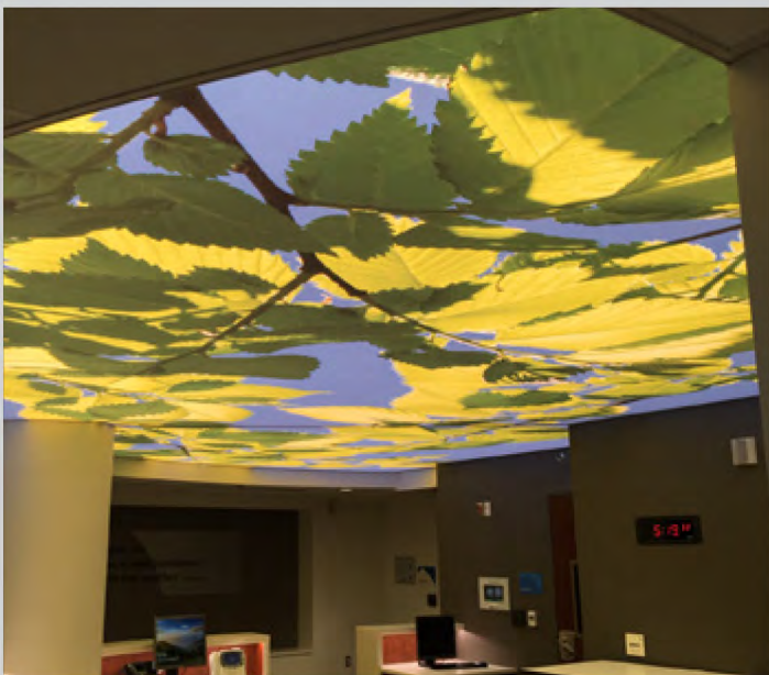
St. Elizabeth Hospital: Milwaukee, WI - Installer: The Huff Company, Inc.