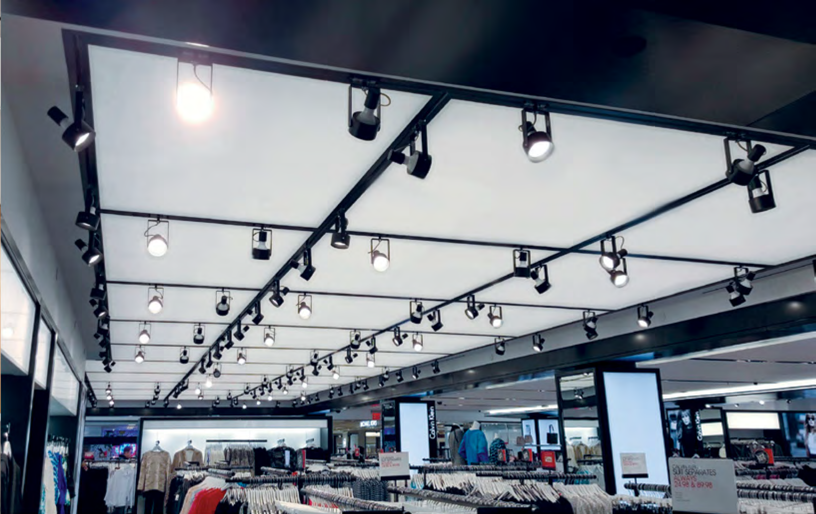
Macy's Flagship Store: New York, NY - Installer: CLIPSO