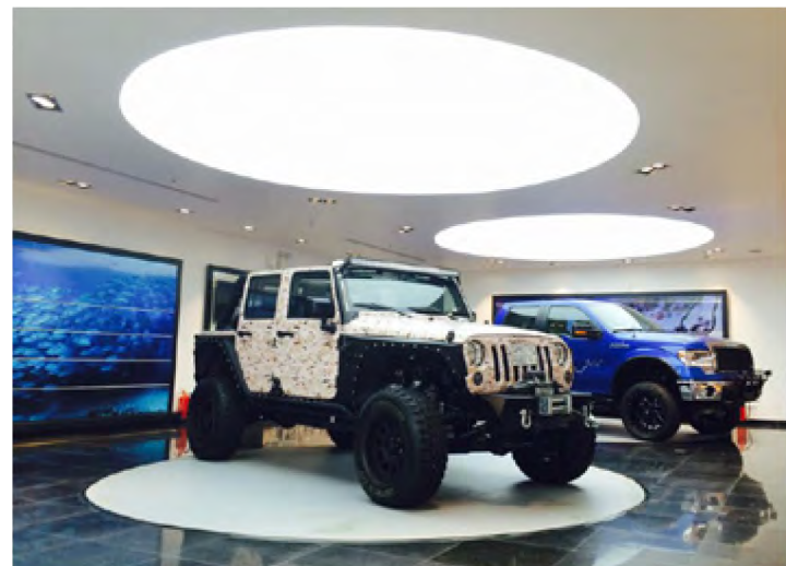
Car dealership: Riyadh, Saudi Arabia