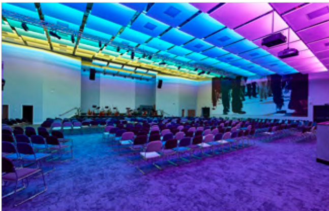
Bridge Community Church: UK - Installer: Acoustic GRG w/Quietwall - Architect: TBC