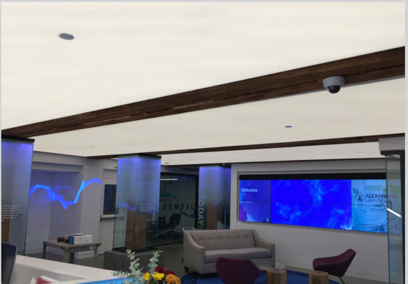
Launch Labs: Cambridge, MA - Installer: Allan Construction - Architect: Perkins & Will - Sales Rep: Hamilton Associates