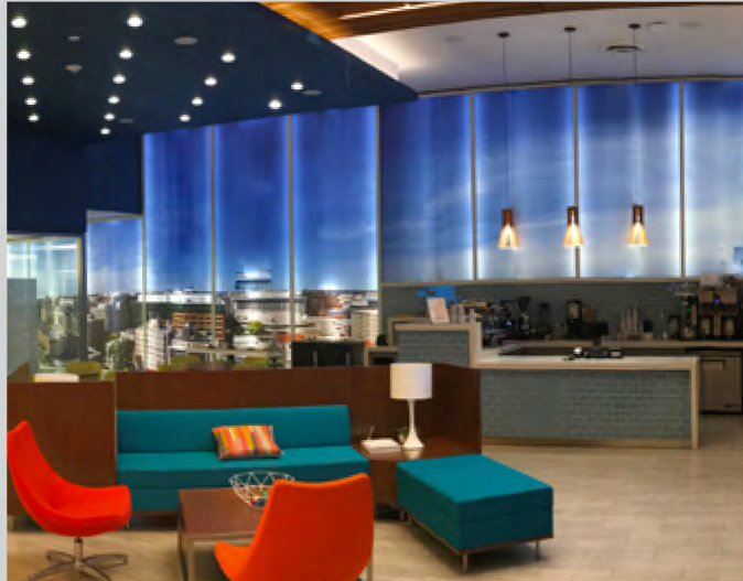
Corporate lounge: Washington D.C. - Installer: Fabric Wall Concepts - Architect: MGAD