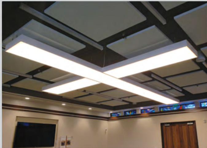
MJS Chapel: Pasadena, CA - Installer: MB Coatings - Architect: Tate Snyder Kimsey Architects

Adding a print allows endless design opportunities. Invite the outdoors in with a custom sky print or other natural landscape scenery. Or use the opportunity to print a logo or other branding element for corporate or retail environments.