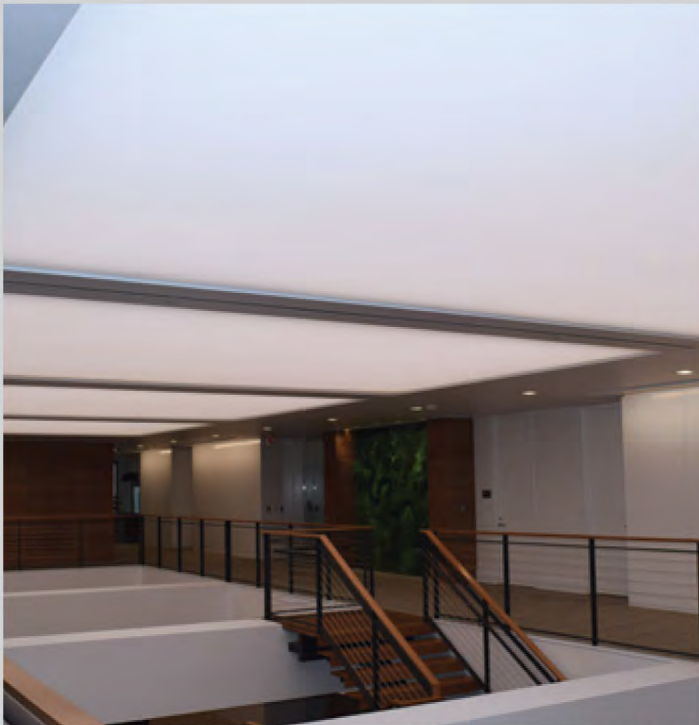
Forest City: Cleveland, OH - Installer: Ketchum & Walton Co. - Architect: Vocon

Good lighting helps to define an interior space. CLIPSO® is proud to offer infinite lighting design options.