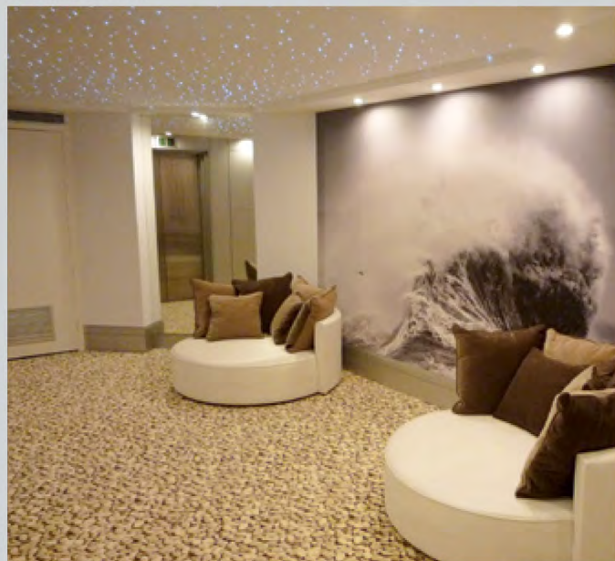
Hotel Elysee Palace: Paris, France - Installer: MJ Plafond - Designer: Nathalie Roux